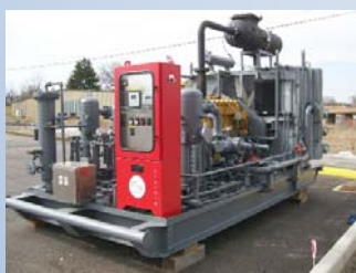
Natural Gas Compressors